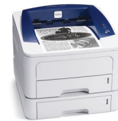
Phaser 3250 shown with optional Tray 2