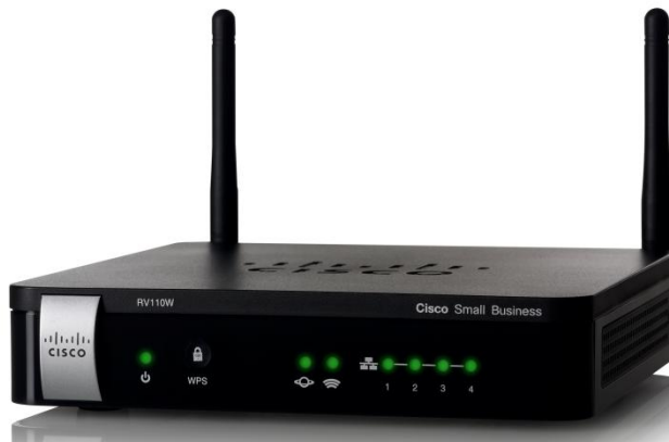
Figure 1 Cisco RV110W Wireless-N VPN Firewall

The Cisco® RV110W Wireless-N VPN Firewall provides simple, affordable, highly secure, business-class connectivity to the Internet for small offices/home offices and remote workers.