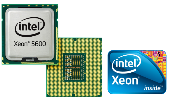
Figure 3. Intel Xeon 5600 Series Processor

Increased reliability, availability, and serviceability through optional dual-redundant power supplies that meet Climate Smart specifications