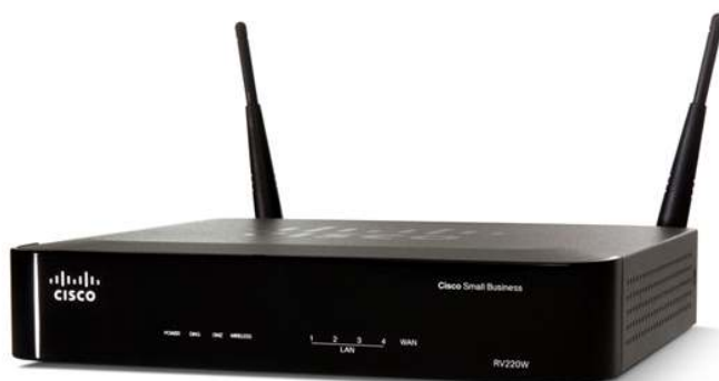
Figure 1. Cisco RV220W Network Security Firewall

To help further safeguard your network and data, the Cisco RV220W includes business-class security features and optional cloud-based Web filtering. Setup is simple, using a browser-based configuration utility and wizards.