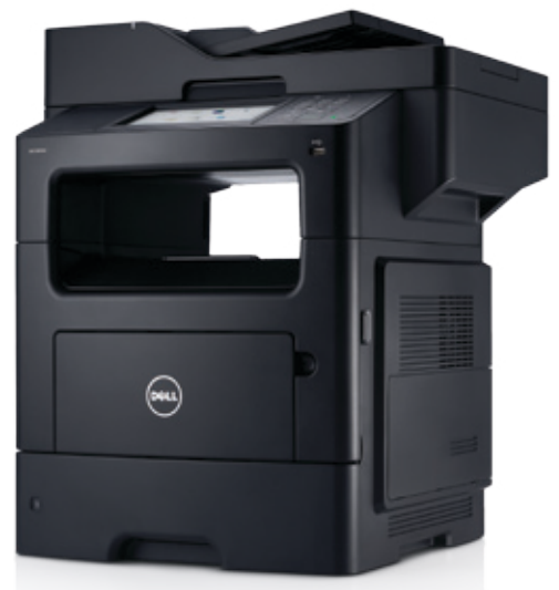
Dell™ B3465dnf Mono Laser Multifunction Printer

Match your growing business needs with this multifunction workgroup printer and gain efficiency for your business.