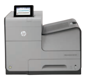
HP Officejet Enterprise Color X555dn

A printing revolution for your enterprise. Produce color documents at up to twice the speed and half the cost per page of color lasers.<sup>1,2</sup> Designed with advanced security and full manageability, this enterprise printer is built to last.